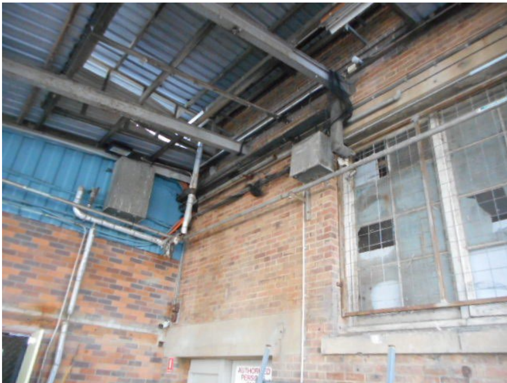
Photo 3403 - 2 - Exterior Soffit - Lining