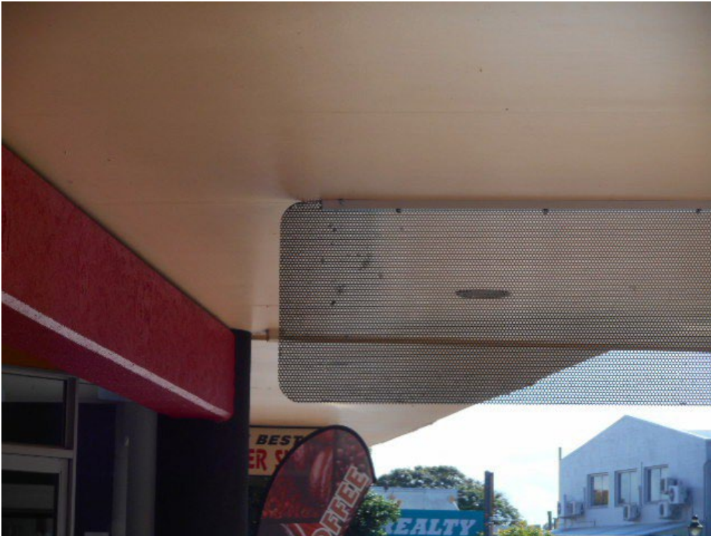
Photo 3385 - G - Exterior - Support Columns