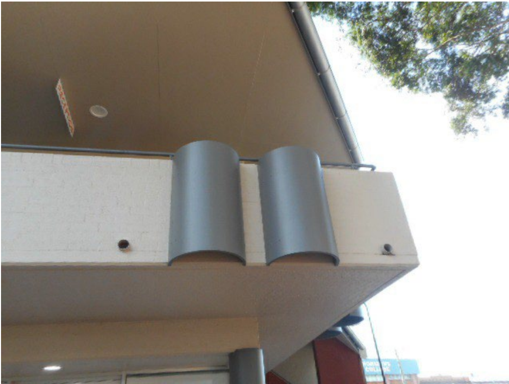
Photo 3363 - 1 - Soffit - Lining