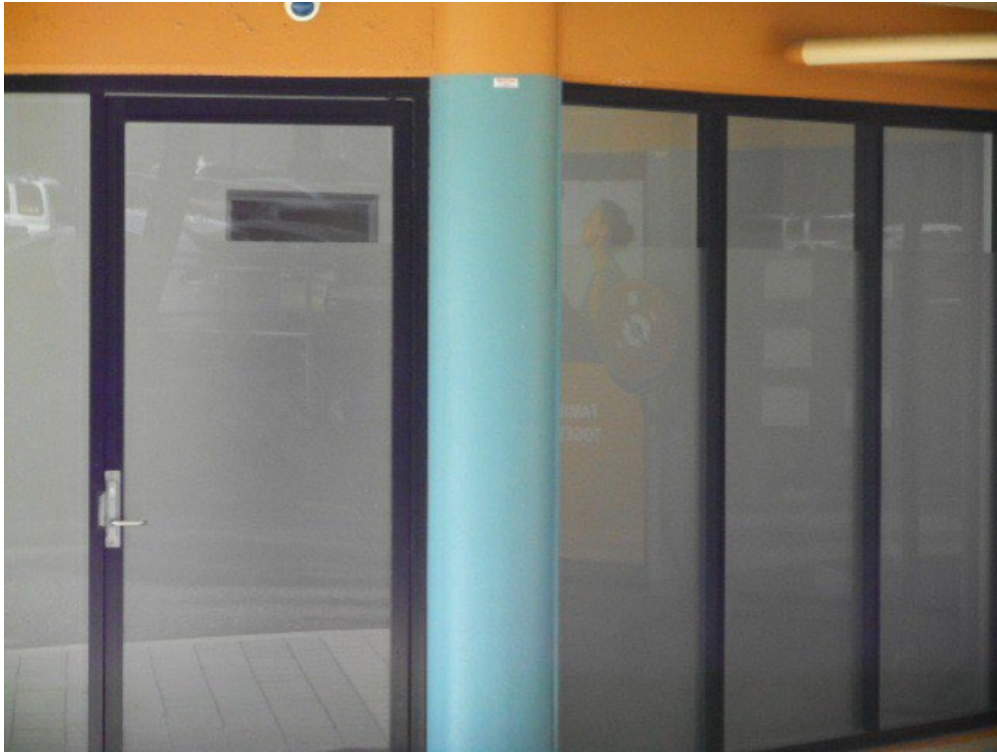
Photo 3375 - G - Soffit - Lining