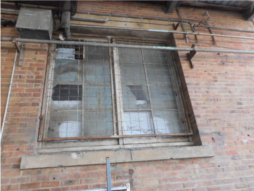
Photo 3357 - G - Exterior Windows - Putty