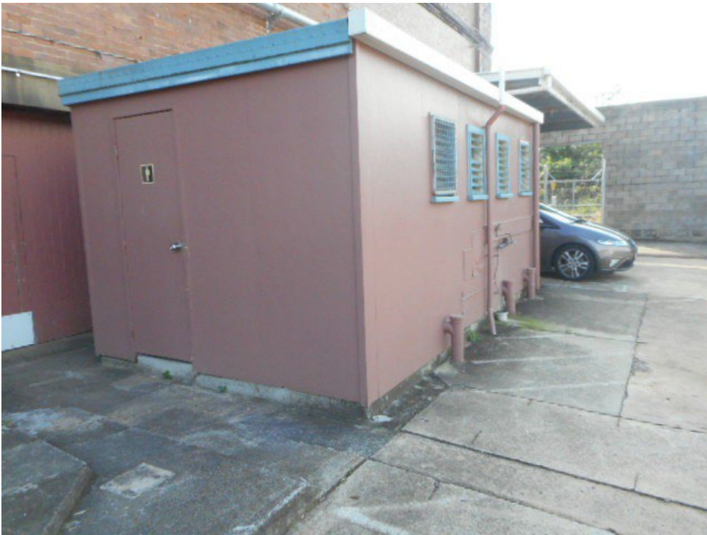
Photo 3358 - G - Toilets - Cladding