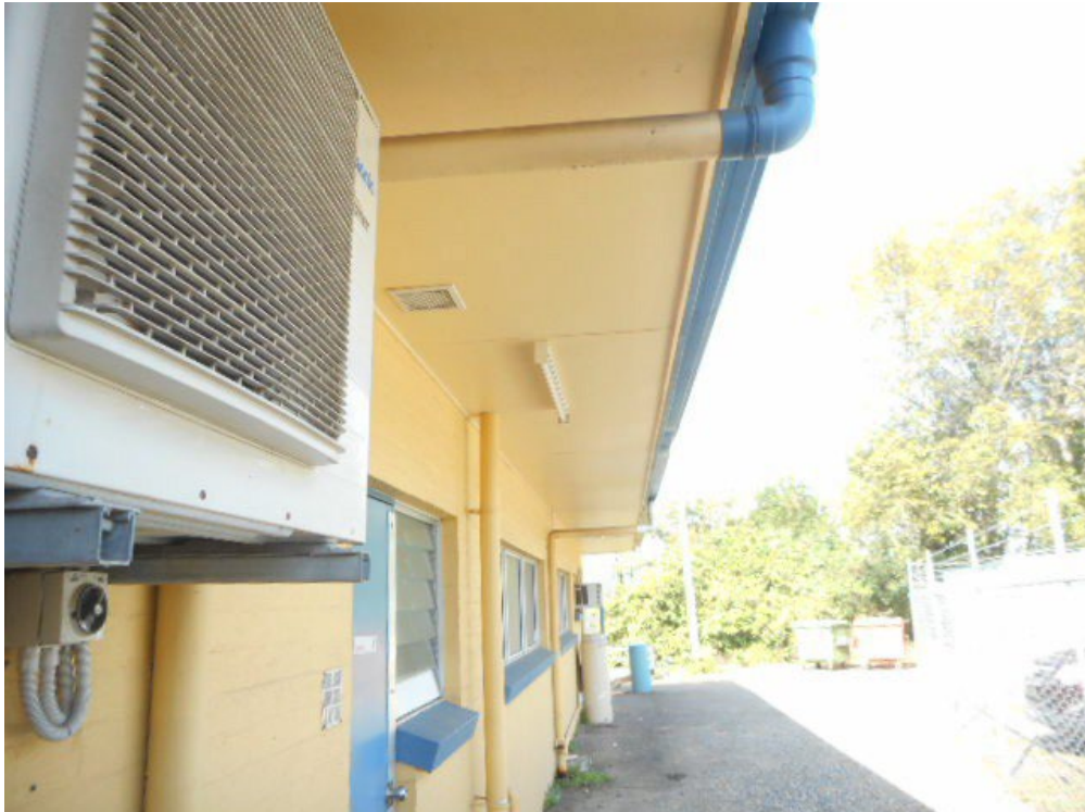
Photo 3390 - G - Rear Soffit - Lining