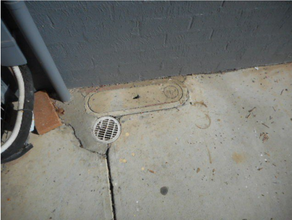
Photo 3369 - G - Toilets - Partitions