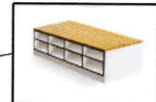
bench and shoe locker beneath