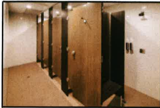
Shower cubicle with bench